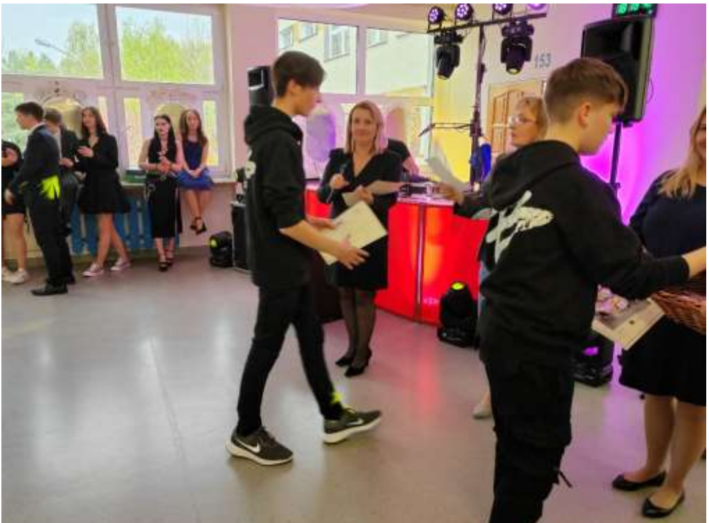
Zaključni večer in podeljevanje certifikatov