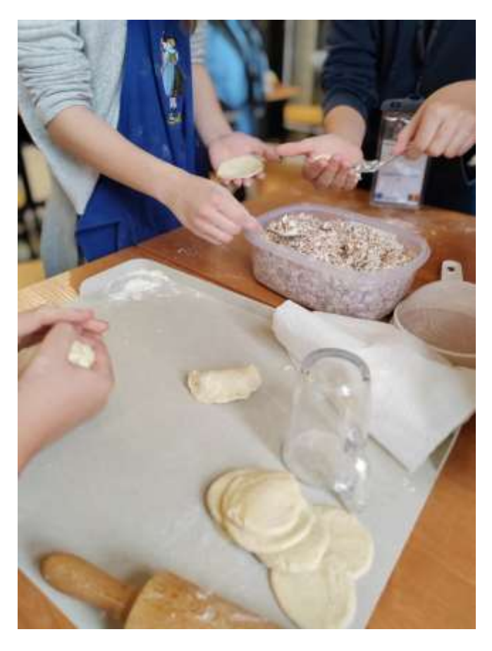
Aktivnosti v šoli - kuhanje