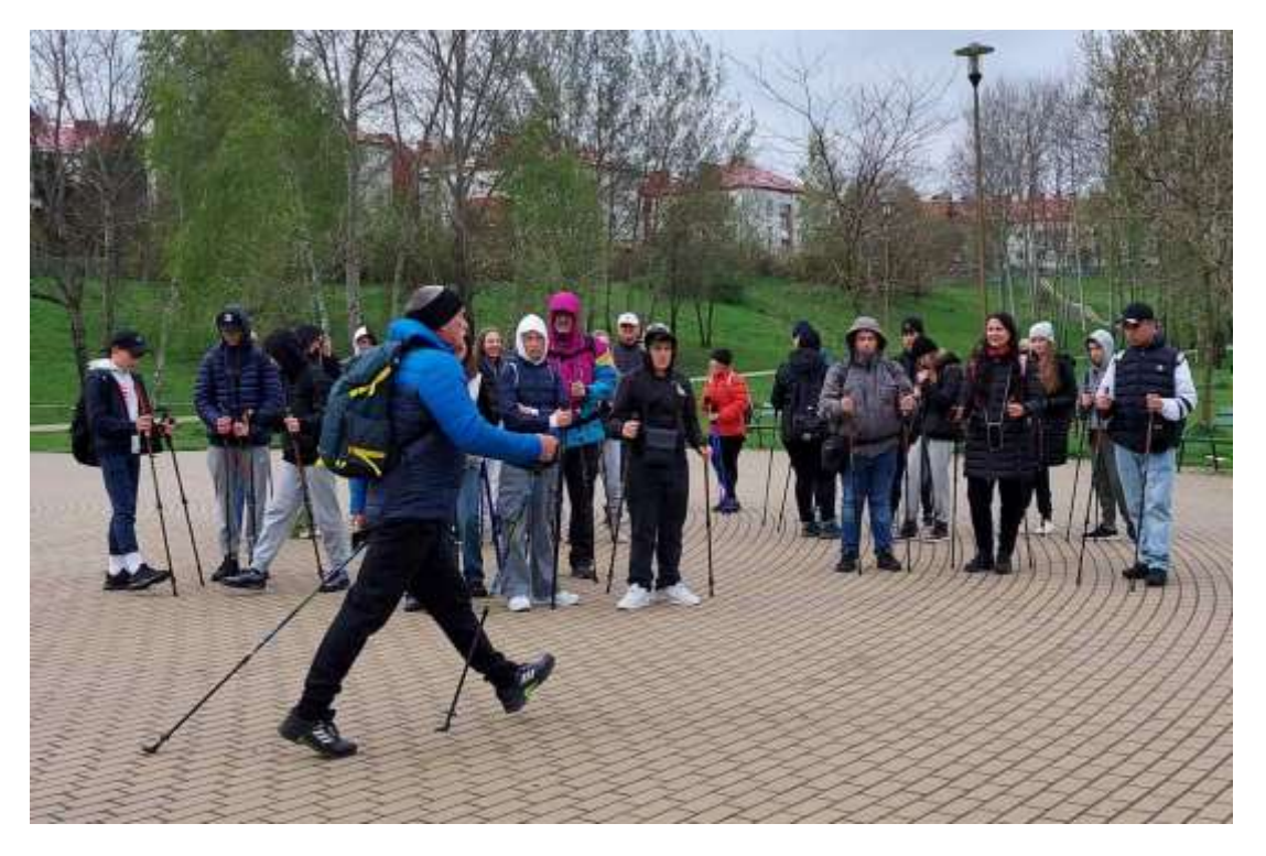
Predstavitev nordijske hoje