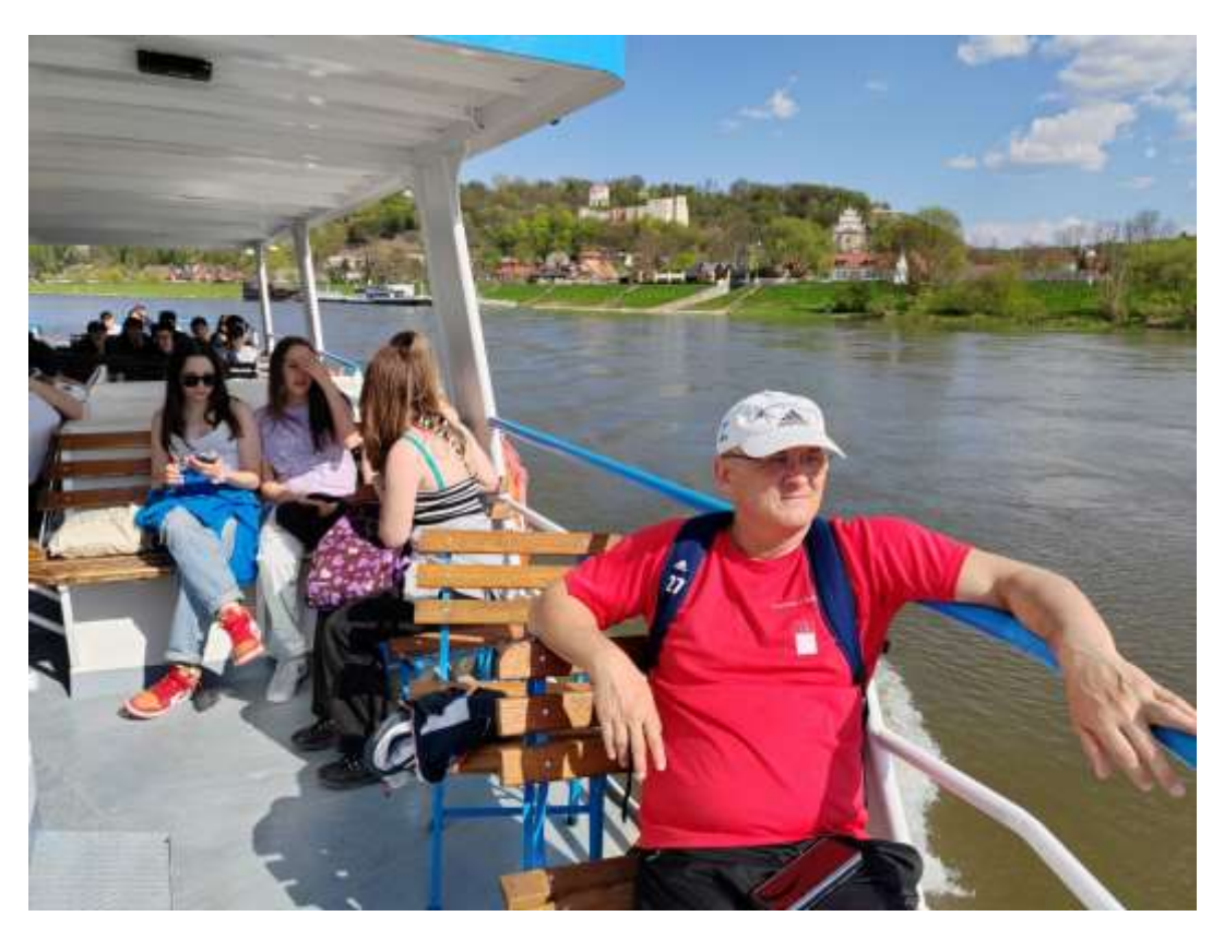
Plovba po reki Visli